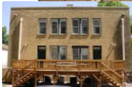
Front and rear views of our new building.