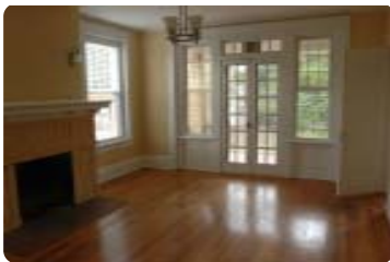
An interior office space