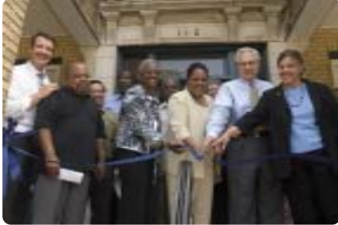
CRA-NC Board cuts ceremonial dedication ribbon.

F or 20 years, CRA-NC has advocated for policies and programs that help renters to become homeowners and to create investment in distressed neighborhoods. We finally were able to follow our own advice.